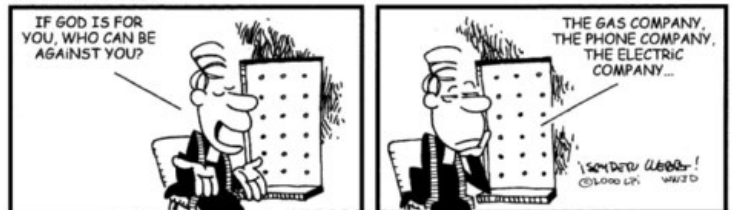
2nd SUNDAY OF LENT

The American Red Cross is experiencing an emergency blood shortage as the nation faces the lowest number of people giving in 20 years. Call 1–800–733–2767 or visit redcrossblood.org to donate.