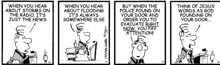
4 th SUNDAY IN ORDINARY TIME

“Put yourself in God’s hands; He abandons no one.” -St. Andres Bassette